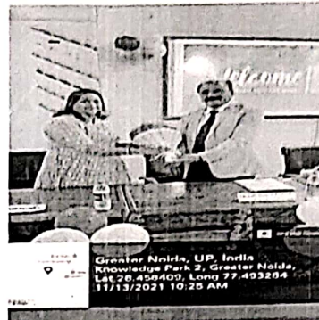
felicitation of guest with bouquet