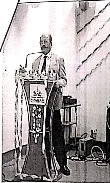
Resource person taking session