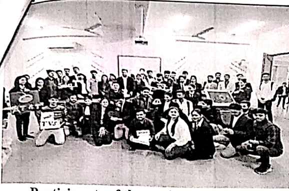
Participants of the session