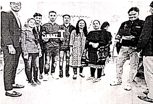
Participants of the session