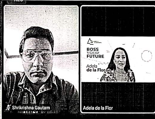
Students attending the session